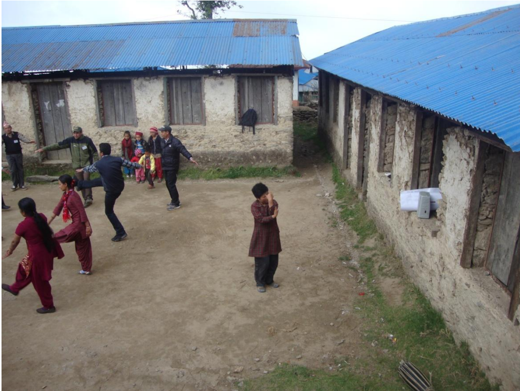
Pict. 1 Teachers completing brainstorming activities before training